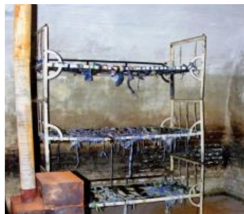
Prison cell with bunkbeds with no mattress, prisoners were obliged to sleep on. Stove for show only, never heated in cold winters.