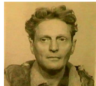
Mug-shot of Late Reverend Richard Wurmbrand when held in the Jilava prison, in communist Romania.